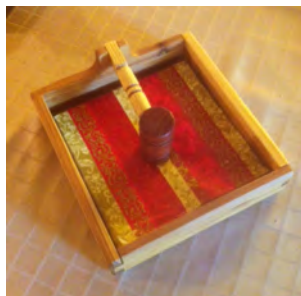
Your choice of a Crows Foot or an Attitude Adjuster to hold down the serviettes