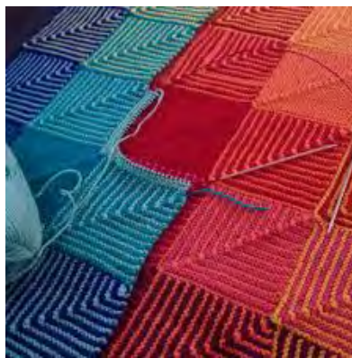
Magic Squares Knitting