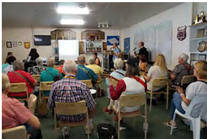
Ukulele and guitar sessions in the Club House

And everyone else the frazzled Crows have forgotten to specifically mention.